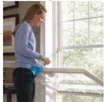
Both sashes of Window World Double-Hung Windows tilt in for easier, safer cleaning from inside your home.

Featuring a beautifully refined silhouette and advanced energy-saving technology, our 4000 Series delivers exceptional style, strength, energy efficiency and value – everything today's homeowners are looking for in a quality replacement window, and more.